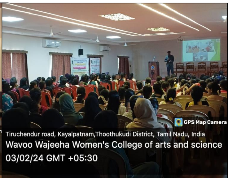
Figure 2: Chief guest addressing the gathering