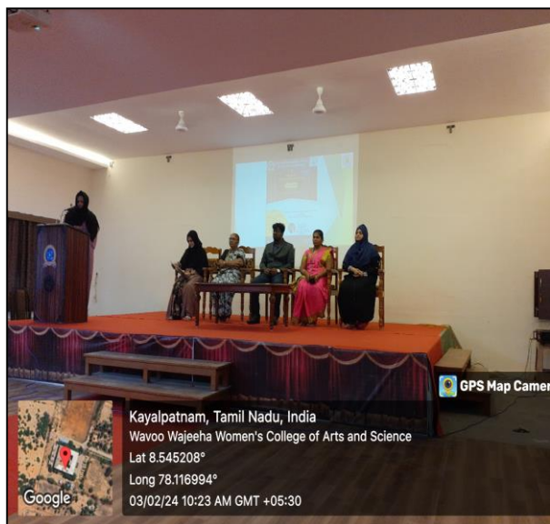
Figure 1: Quirath recitation