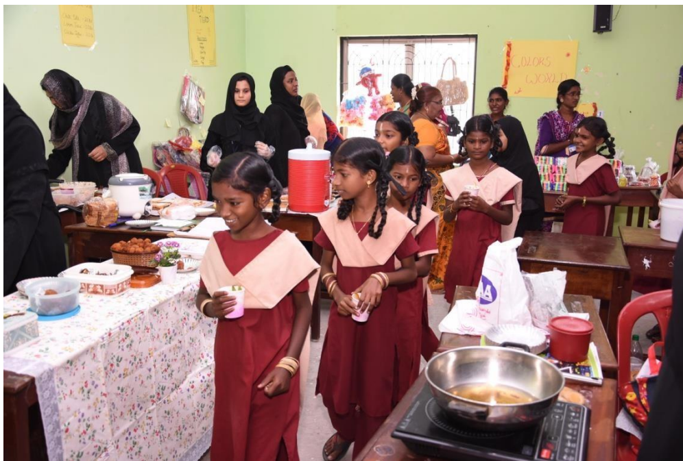
Fig1: School students visiting the EDC stall

On 19.02.2019 EDC joined hands with BBA, Commerce and economics and conducted Sales Fair. Students of these department participated as a sales manager, Accountant and Production manager. On this occasion School students from nearby students visited the stall with enthusiasm.