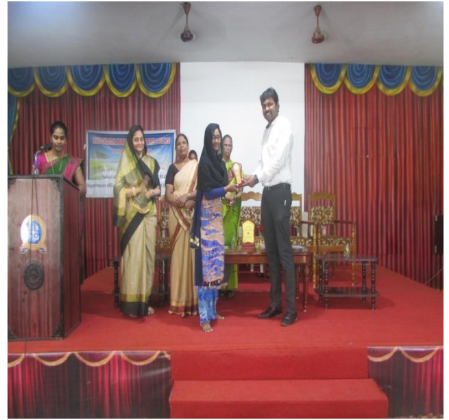
Fig3: Sales Fair valedictory