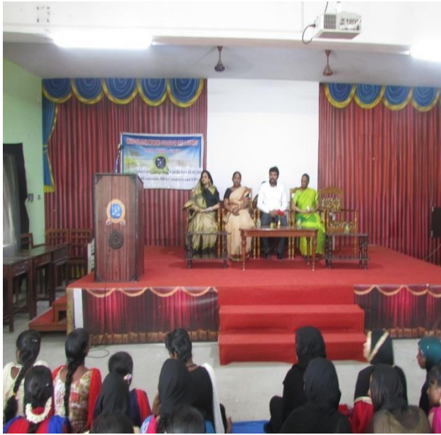
Fig2: Sales Fair valedictory