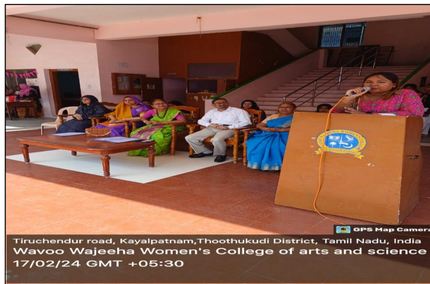
Fig. 1: Chief Guest addressing the young entrepreneurs

After that, honourable chief guest inaugurated the sales fair and visited the stalls exhibited by the students and alumnae. She also appreciated the innovative ideas displayed by the students.