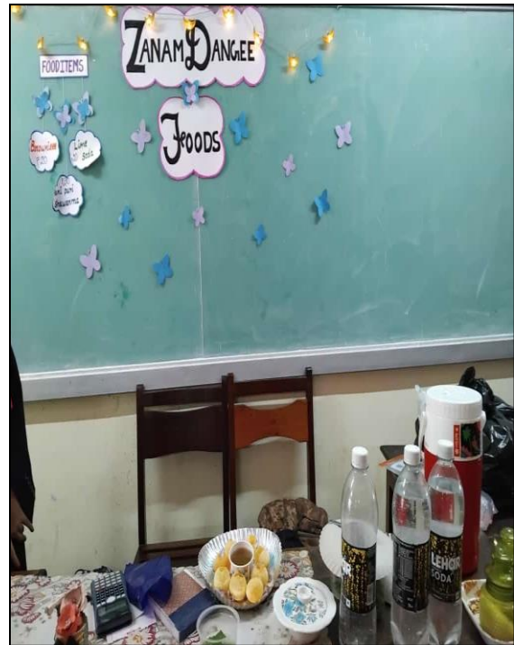
Fig. 4 & Fig. 5: Stalls displayed by the students